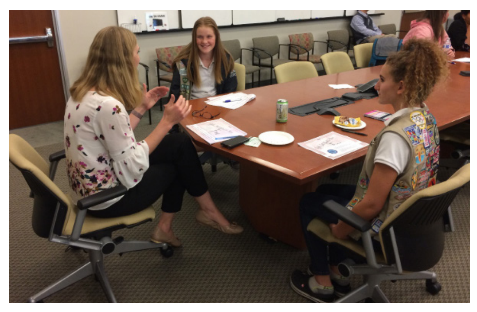
Girl Scout Cadettes meet with a representative from PAAMCO. STEM Consortium Sponsored events and programs provide Girl Scouts across Orange County with hands-on, real-world opportunities to connect with science, technology, engineering, and math and explore possible careers in STEM fields through role models from STEM Consortium sponsors.

Launched in 2015, it is the first collaboration of its kind in OC to bring leading STEM companies together with Girl Scouts of Orange County to support diverse and enriching STEM programs and experiences for OC's nearly 15,000 Girl Scouts.