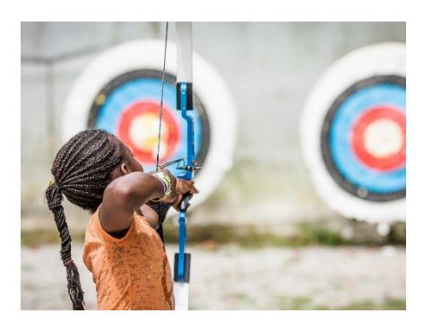
Archery Council Approval: Required