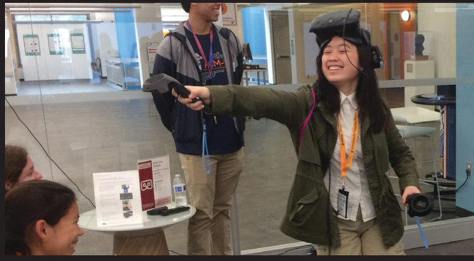
GIRL SCOUTS EXPLORE VIRTUAL REALITY WITH COLLEGE MENTORS AT THE TITAN LAB ADVENTURES EVENT.

In 2019, 7,945 OC Girl Scouts in kindergarten through 12th grades earned badges in STEM and 1,085 girls participated in council-run STEM events, including Girl Scouts of Orange County's annual STEM Expo at California State University, Fullerton and career exploration with Titan Lab Adventures, Ericsson's Summer Connect robotics event, and a beach cleanup and weather education program hosted by Surfline and organized by Girl Scouts of Orange County's volunteer STEM Patrol.