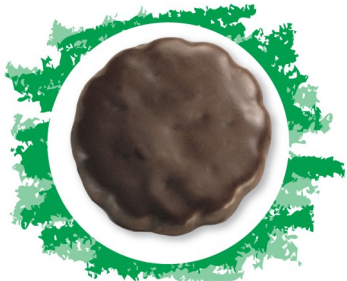
1. Thin Mint