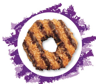
2. Caramel deLites